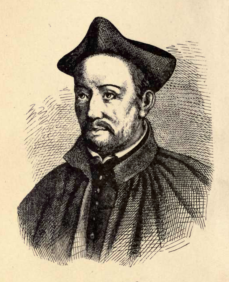
Ignatius Loyola .