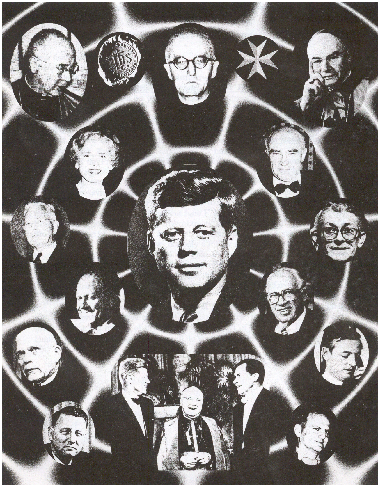
Francis Cardinal Spellman's Network of Assassins, 1963 ##5*